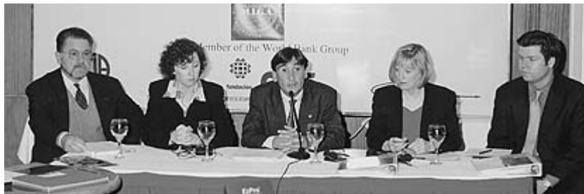
MIGA representatives meet with Mendoza province business leaders to discuss investment promotion

Two regional authorities in Argentina are working with MIGA's IMS Department to develop and implement a high-profile strategy to attract investment. Following an investigative visit by IMS in September 1998, the Argentine Industrial Union, requested MIGA to conduct two regional workshops. With much of the foreign direct investment concentrating near Buenos Aires, both the City of Mar del Plata and the Province of Mendoza are aiming to raise their visibility as locations for investment. In May, a MIGA team conducted two workshops covering image building, investment generation, investor servicing, and promotion strategy techniques. The audiences included municipal authorities, regional politicians, business associations, company directors, and representatives from the banking and telecommunications sectors. The sessions concluded with the formulation of concrete steps to implement the promotion strategies in the upcoming months.