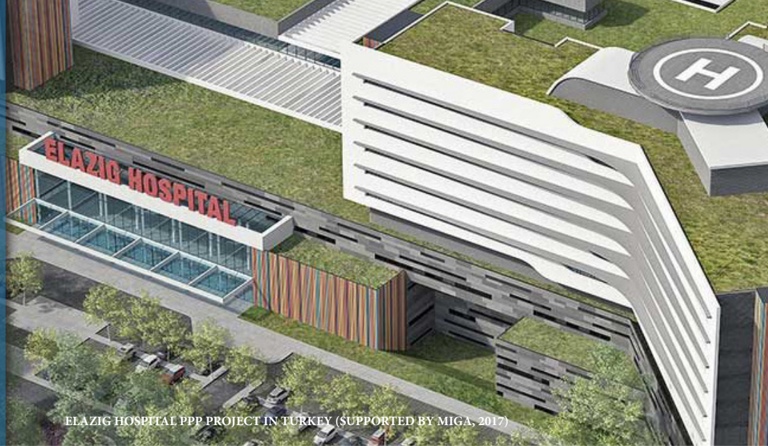
ELAZIG HOSPITAL PPP PROJECT IN TURKEY (SUPPORTED BY MIGA, 2017)

MIGA's mission is to promote foreign direct investment (FDI) into emerging economies to improve people's lives and reduce poverty. We fulfill our mission by providing political risk insurance guarantees to private sector investors and lenders. MIGA's guarantees protect investments against non-commercial risks and can help investors obtain access to funding sources with improved financial terms and conditions. Our unique strength is derived from our standing as a member of the World Bank Group and our structure as an international organization with our shareholders including most countries of the world. Since our inception in 1988, MIGA has issued more than $28 billion in political risk insurance for projects in a wide variety of sectors, covering all regions of the world. MIGA-insured projects encompass a broad range of sectors, including banking, mining, manufacturing, agribusiness, telecommunications and others.