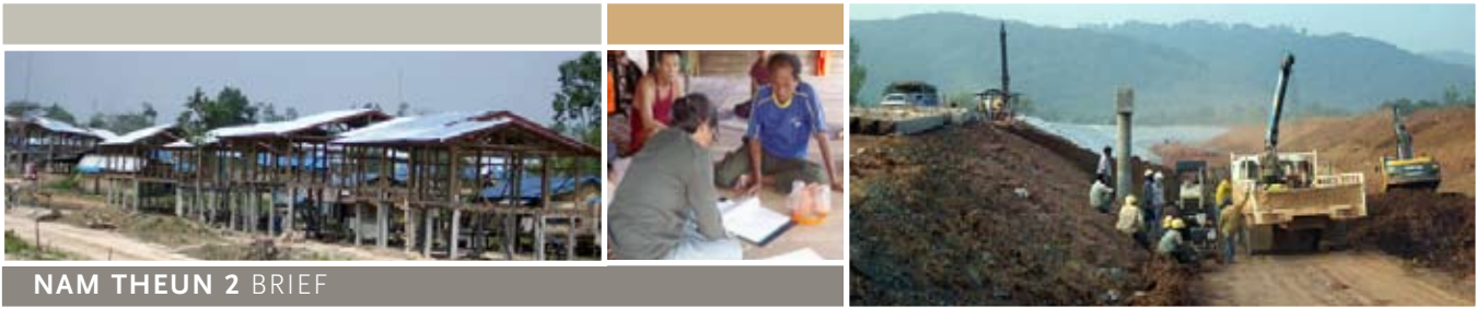
NAM THEUN 2 BRIEF

WORLD BANK GROUP MULTILATERAL INVESTMENT GUARANTEE AGENCY