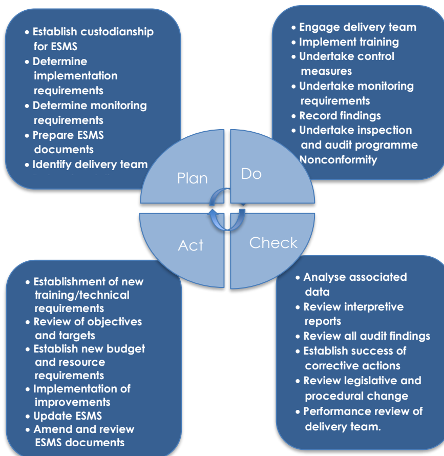
Figure 3-1 Implementation Process

An outline implementation process for ESMS is illustrated in the figure below.