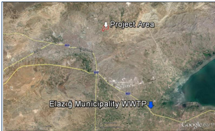
Figure 8-3: The location of Elazig Municipality WWTP

Elazig Municipality WWTP is located on the 17 th km of Elazig-Bingol State Highway (Figure 8-3) to the south of the Project area at an approximate distance of 12 km.