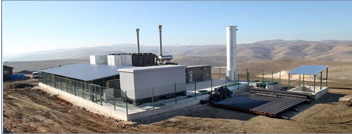
Figure 8-1: Elazig solid waste disposal facility